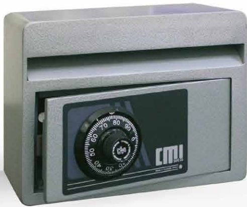
MODEL DEP 2C