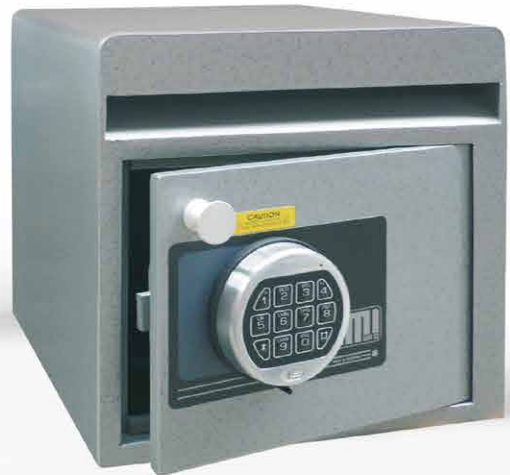
MODEL DEP 3D

MINI DEPOSIT SAFES are ideal for moderate security where multiple staff need to deposit money into the safe.