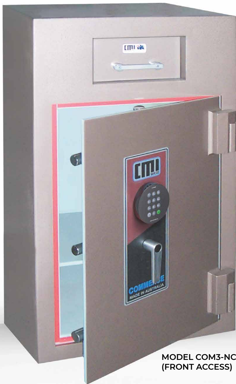
MODEL COM3-NC (FRONT ACCESS)

TO SUIT COMMERCE, PREMIER OR COMMANDER SAFES