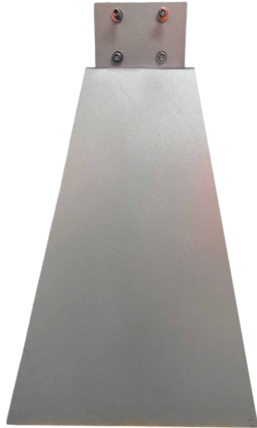
MODEL GKC1-S - FRONT