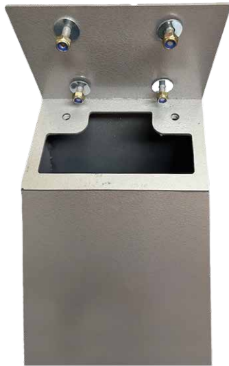
MODEL GKC1-S - TOP