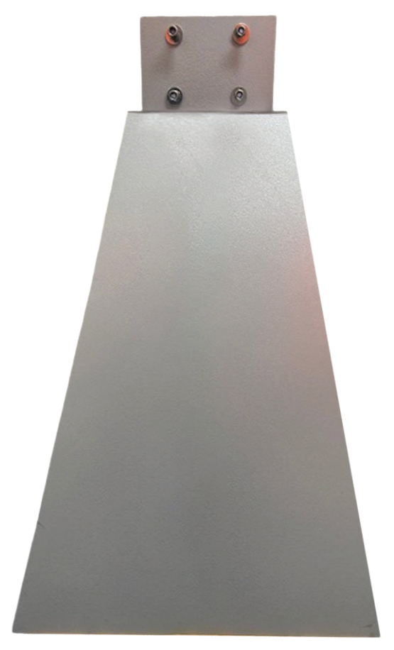
MODEL GKC1-S - FRONT