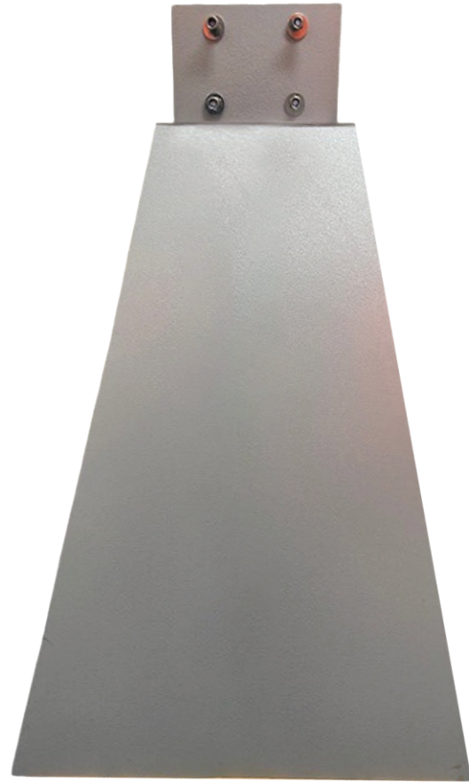
MODEL GKC1-S - FRONT