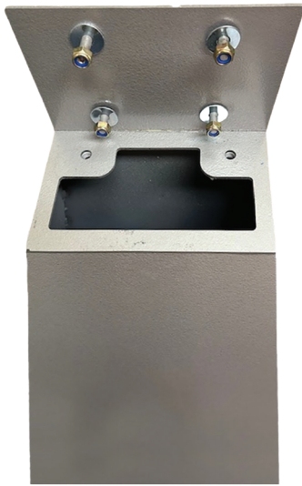
MODEL GKC1-S - TOP