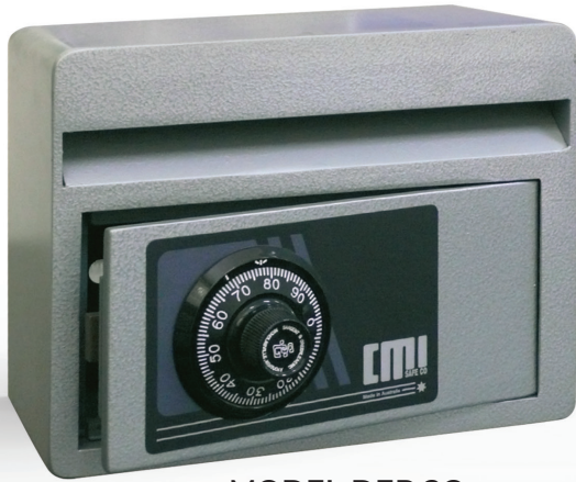
MODEL DEP 2C