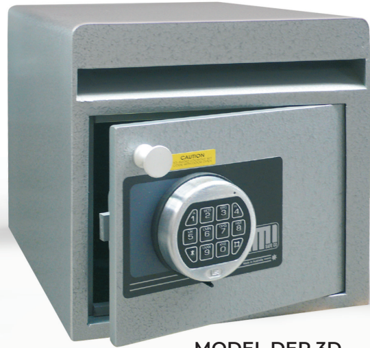
MODEL DEP 3D

MINI DEPOSIT SAFES are ideal for moderate security where multiple staff need to deposit money into the safe.