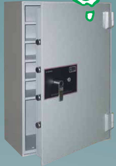
■ MODEL DS900