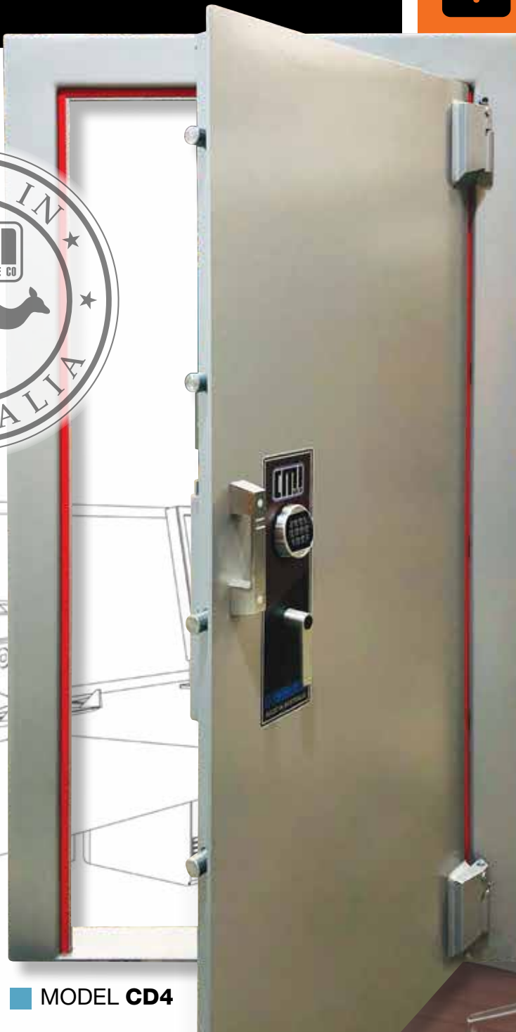
■ MODEL CD4