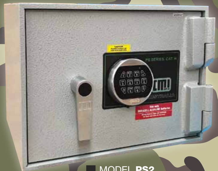
■ MODEL PS2