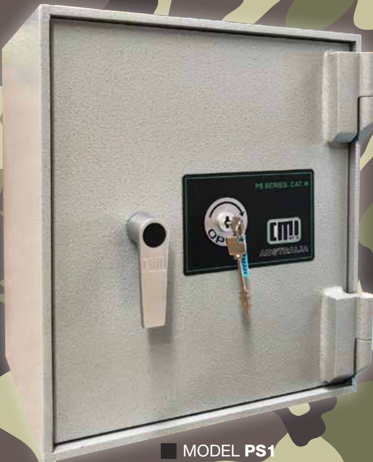
■ MODEL PS1